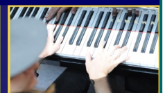
Bachelor of Illustration