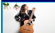
Bachelor of Music