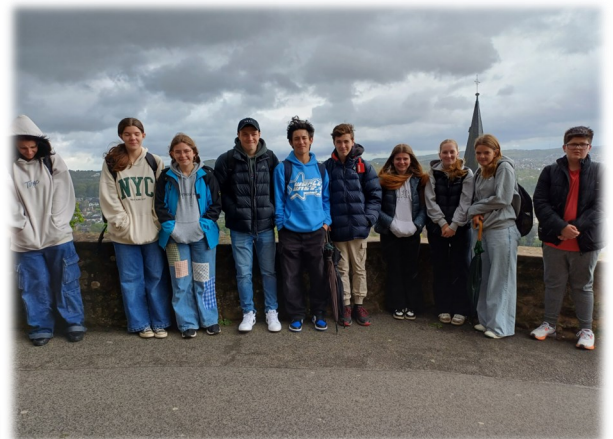
Up at the Castle