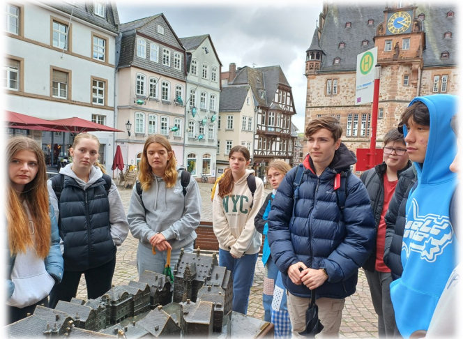
At the Marketplace Marburg