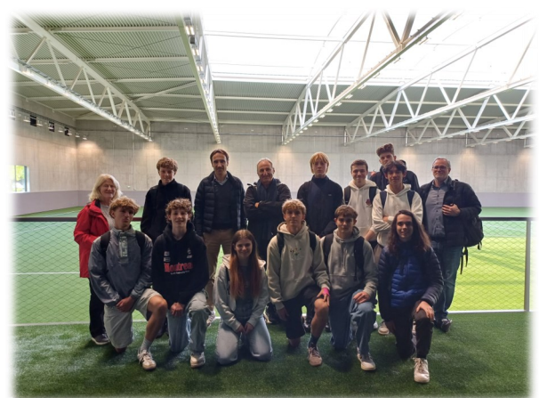
At the DFB Headquarters - Frankfurt