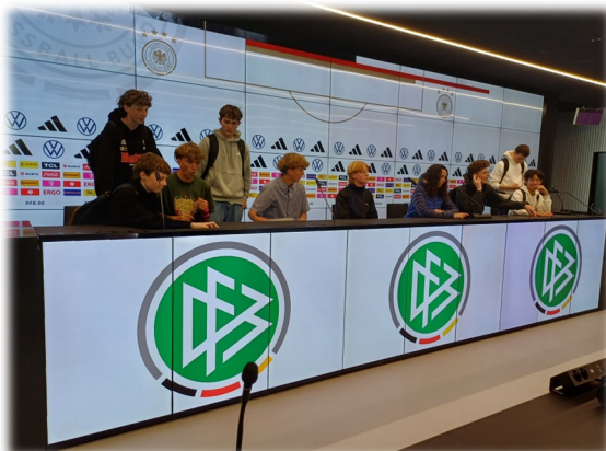
Press Conference at DFB