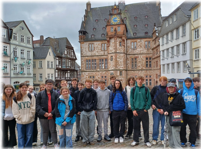
City Tour - Marburg