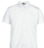
White Shirt - short sleeve