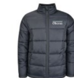
Puffer Jacket Embroidered with Oberon Logo