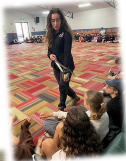
Meeting friends of the slippery kind!